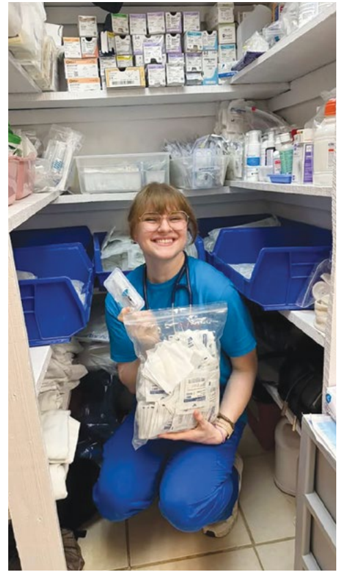
Global Links provided donations to the Duquesne University School of Nursing and School of Pharmacy to hand carry to a health clinic in Roatán, Honduras