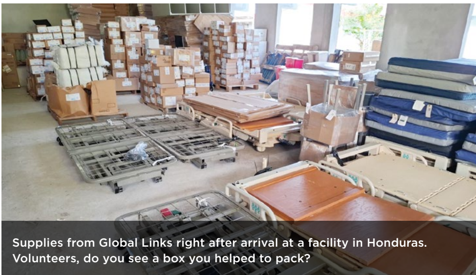
Supplies from Global Links right after arrival at a facility in Honduras. Volunteers, do you see a box you helped to pack?