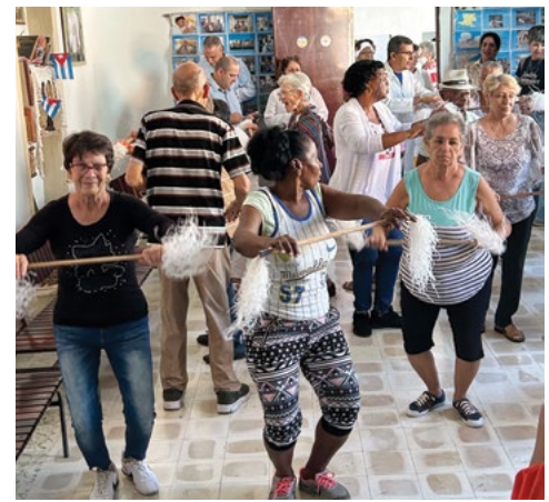
Older adults participate in “dance therapy” to mitigate memory loss at the “Brain Gym” in Matanzas, Cuba, Pittsburgh’s Sister City, where supplies were hand-delivered via our Global Medical Partnership Program. Global Links is one of a handful of nonprofit organizations licensed by the US government to deliver humanitarian aid to the island nation.