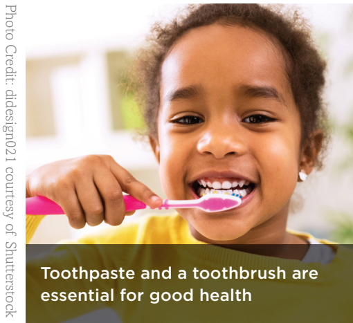
Toothpaste and a toothbrush are essential for good health

Personal hygiene is essential to good health, yet government programs assisting low-income families exclude products like shampoo, toothpaste, and soap, making them a cash purchase. This often results in families having to make tough choices, like paying utility bills or buying soap and deodorant. Our Personal Care Kit Project provides hygiene items to help people meet their basic needs. Global Links partners with local agencies which then distribute the kits directly to the people they serve. So far this year we've been able to impact 1,850 people through partnerships with agencies such as South Hills Interfaith Movement, Human Services Center Mon Valley, Adagio Health and the Department of Human Services for their emergency response.