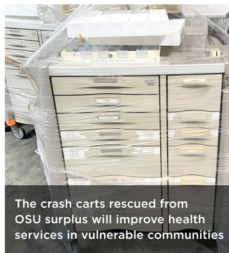
The crash carts rescued from OSU surplus will improve health services in vulnerable communities

Global Links began working with The Ohio State University system earlier this year and because they are both a health system and a university, they have been able to provide essential surplus furnishings and supplies — such as crash carts, exam tables, desks, waiting room chairs and more — that will help meet requests from our international medical aid partners. And we appreciate our warehouse team who are literally going the distance to pick up these materials to impact health! •