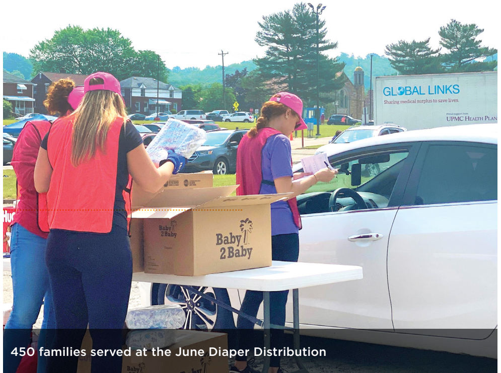
450 families served at the June Diaper Distribution

Personal hygiene is essential to good health, yet government programs assisting low-income families exclude products like shampoo, toothpaste, and soap, making them a cash purchase. This often results in families having to make tough choices, like paying utility bills or buying soap and deodorant. Our Personal Care Kit Project provides hygiene items to help people meet their basic needs. Global Links partners with local agencies which then distribute the kits directly to the people they serve. So far this year we've been able to impact 1,850 people through partnerships with agencies such as South Hills Interfaith Movement, Human Services Center Mon Valley, Adagio Health and the Department of Human Services for their emergency response.