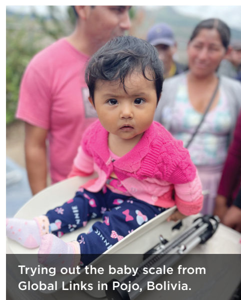
Trying out the baby scale from Global Links in Pojo, Bolivia.