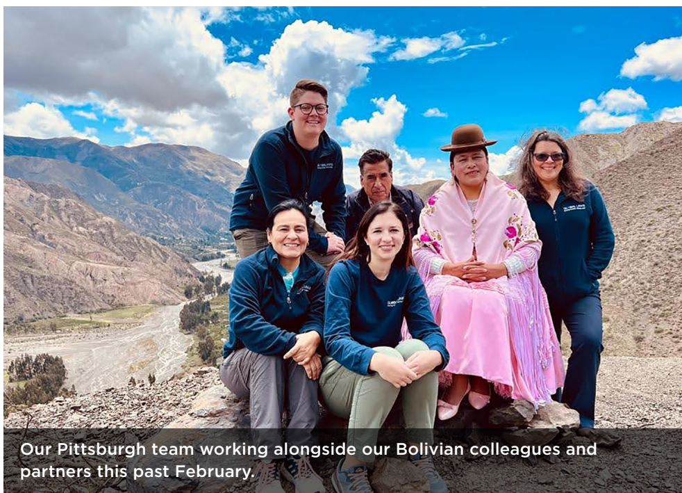
Our Pittsburgh team working alongside our Bolivian colleagues and partners this past February.