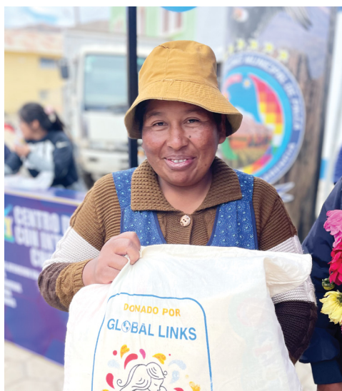
One woman picked up her Baby Bag before taking the several hours-long ambulance ride to her cesarean section appointment.

Evaluation trips also provide the opportunity to meet with the staff at