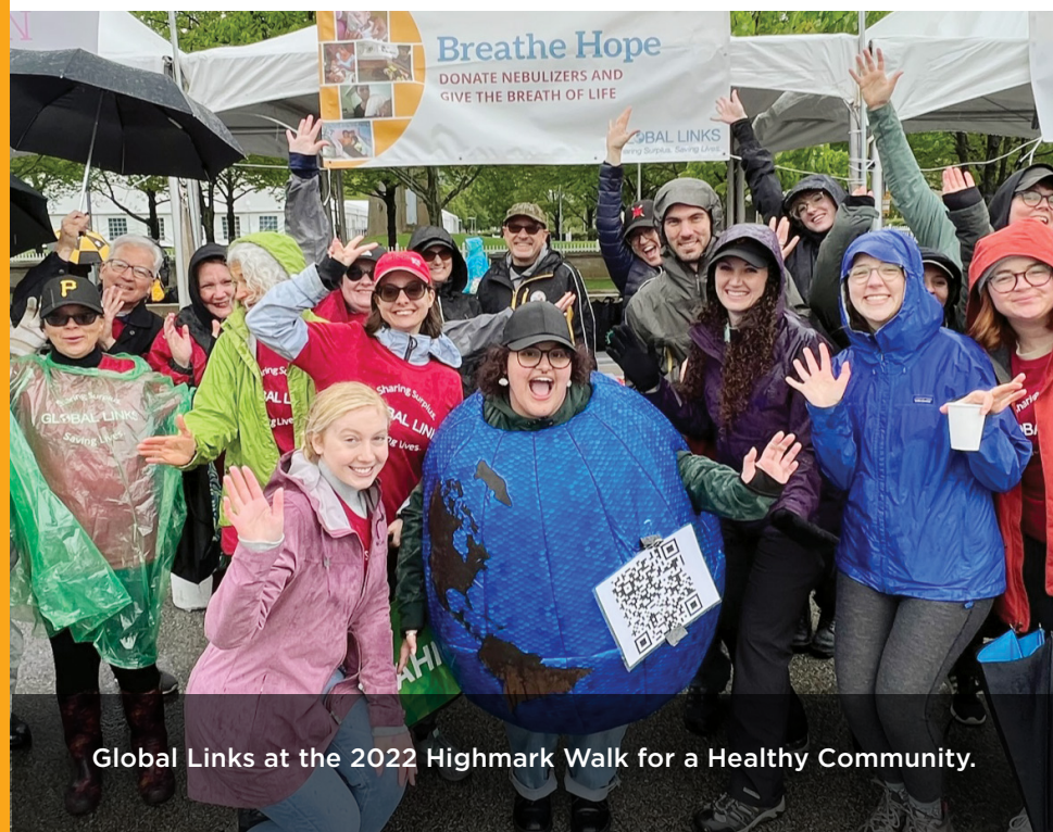
Global Links at the 2022 Highmark Walk for a Healthy Community.

Highmark is an Independent Licensee of the Blue Cross and Blue Shield Association