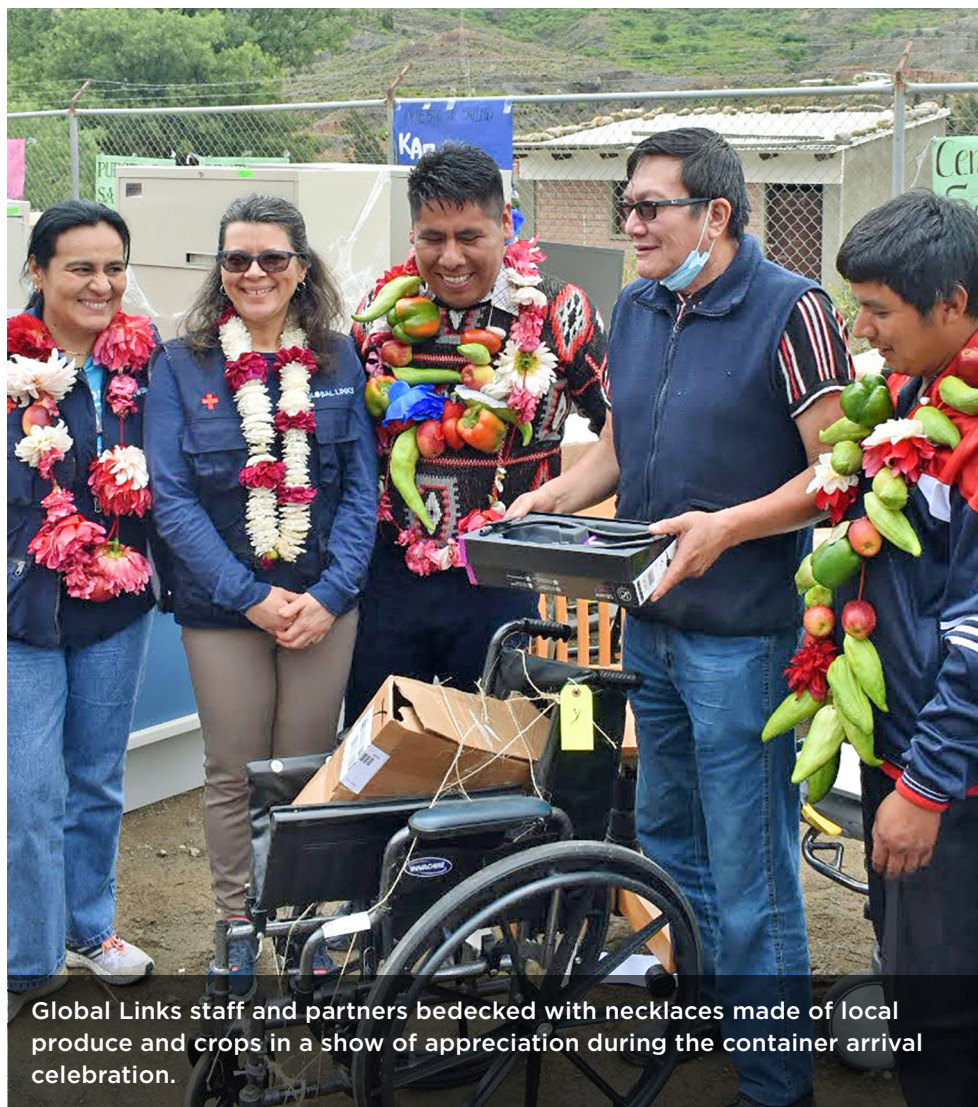
Global Links staff and partners bedecked with necklaces made of local produce and crops in a show of appreciation during the container arrival celebration.