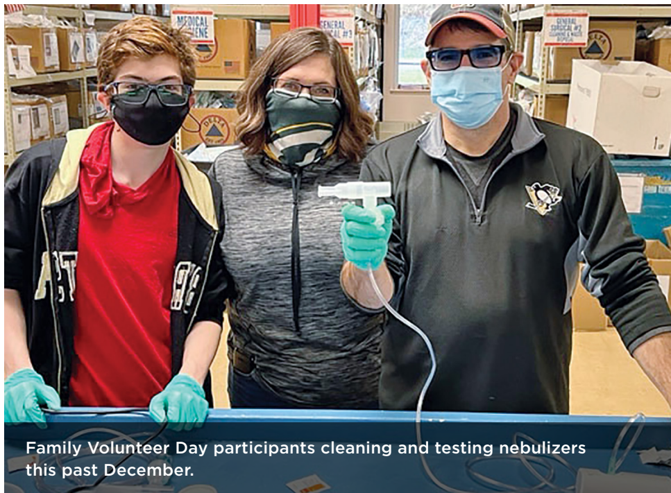
Family Volunteer Day participants cleaning and testing nebulizers this past December.

Do you have home medical and mobility equipment in good condition that you no longer need? We are especially in need of knee scooters and rollator walkers. Do you work for a senior center or medical facility with surplus mobility equipment? We are very interested in any manual wheelchairs you are no longer using. Do you work for a business, university or medical facility with desks and chairs you no longer need? We can put these donations to good use improving health. Contact us at medicalsurplus@globallinks.org to learn more or visit our website on the "Our Programs" tab and then click "Medical Surplus Recovery."