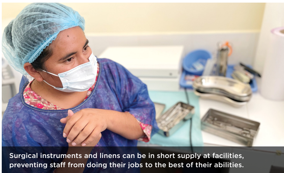
Surgical instruments and linens can be in short supply at facilities, preventing staff from doing their jobs to the best of their abilities.